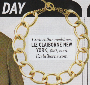
Link collar necklace, LIZ CLAIBORNE NEW YORK , $50, visit lizclaiborne.com