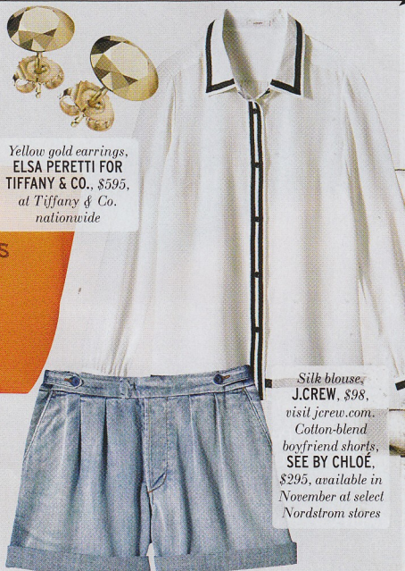
Yellow gold earrings, ELSA PERETTI FOR TIFFANY & CO. , $595, at Tiffany & Co. nationwide