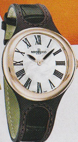
Rose gold bezel watch with calfskin and alligator strap, SERENA GARBO BY BERTOLUCCI , $4,700, at Kenjo, NYC