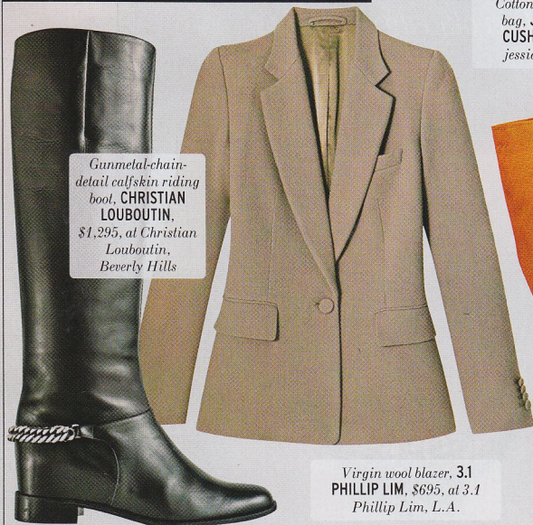
Gunmetal-chain-detail calfskin riding boot, CHRISTIAN LOUBOUTIN , $1,295, at Christian Louboutin, Beverly Hills