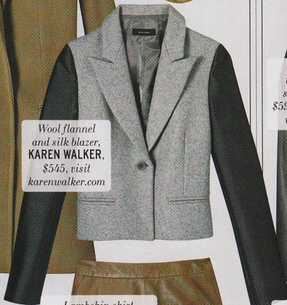
Wool flannel and silk blazer, KAREN WALKER , $545, visit karenwalker.com