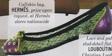
Lace and patent leather stud-detail flat, CHRISTIAN LOUBOUTIN , $695, at Christian Louboutin, NYC