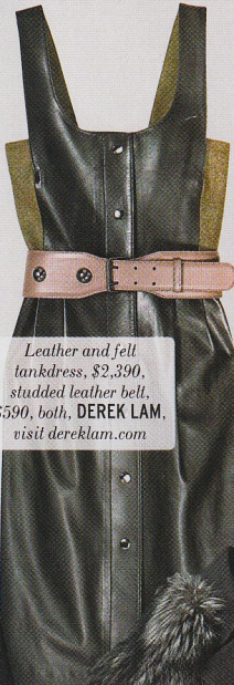
Leather and felt tank dress, $2,390, studded leather belt, $590, both, DEREK LAM , visit derekklam.com