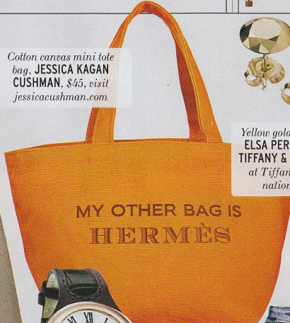
Cotton canvas mini tote bag, JESSICA KAGAN CUSHMAN , $45, visit jessicacushman.com