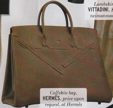
Calfskin bag, HERMÈS , price upon request, at Hermès stores nationwide