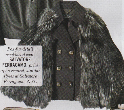
Fox-fur-detail wool-blend coat, SALVATORE FERRAGAMO , price upon request, similar styles at Salvatore Ferragamo, NYC