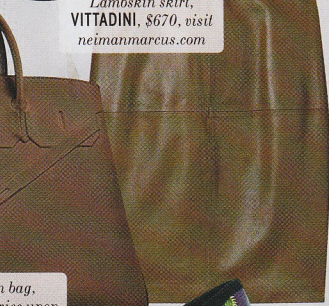
Lambskin skirt, VITTADINI , $670, visit neimanmarcus.com