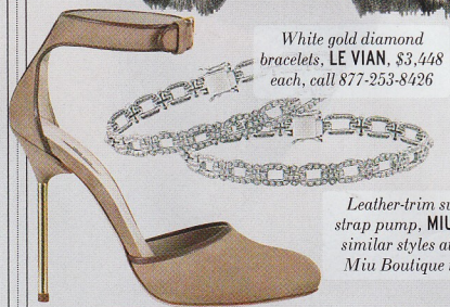
White gold diamond bracelets, LE VIAN , $3,448 each, call 877-253-8426